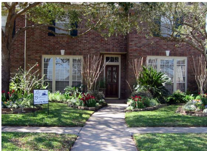
MARCH YARD of the MONTH 1902 Lakewinds Drive